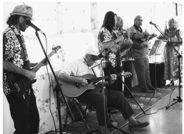
A BIG MAHALO to the Kupuna Serenaders for their joyful mele.