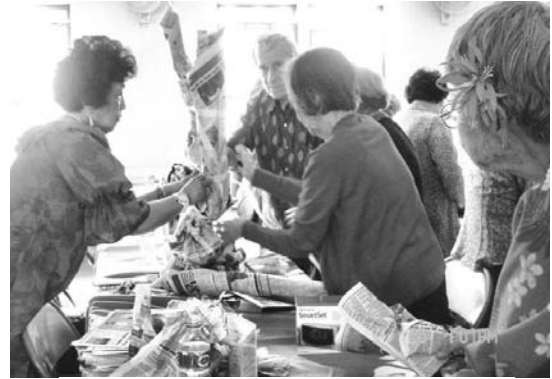
Flight Control Tower ?