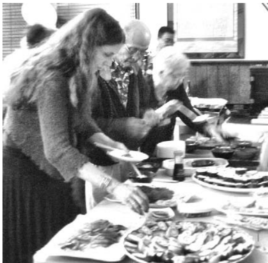
Members partake of the New Year's Eve mini-banquet.