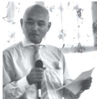
Sensei sings a favorite Japanese Tune.