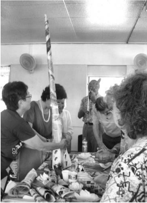
Eiffel Tower ?