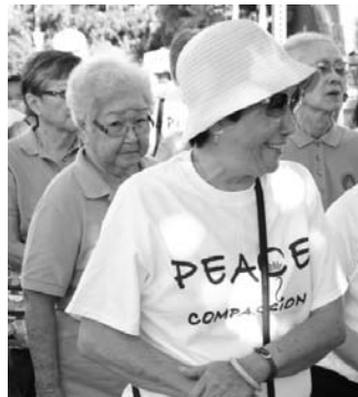
MUBWA for Peace & Compassion