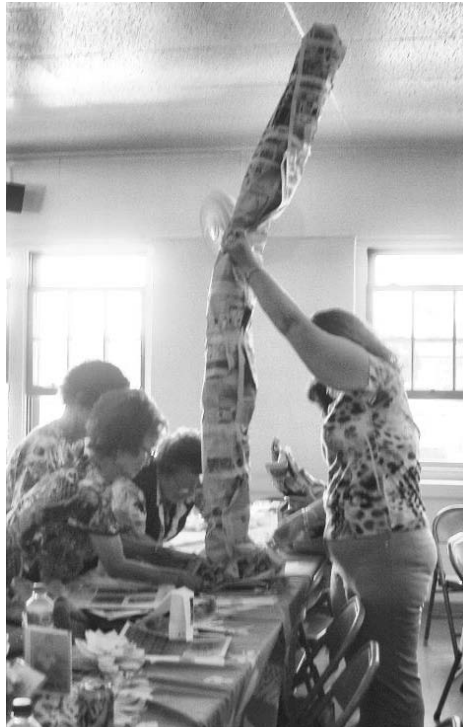
Pioneer Mill Smokestack ?