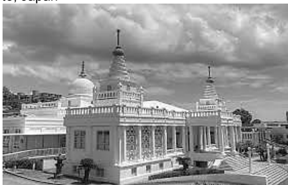
Honpa Hongwanji Mission of Hawaii