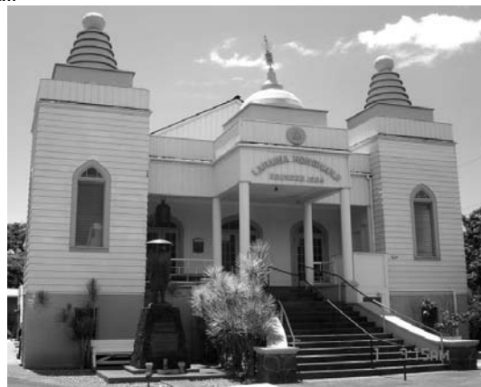
Lahaina Hongwanji Mission