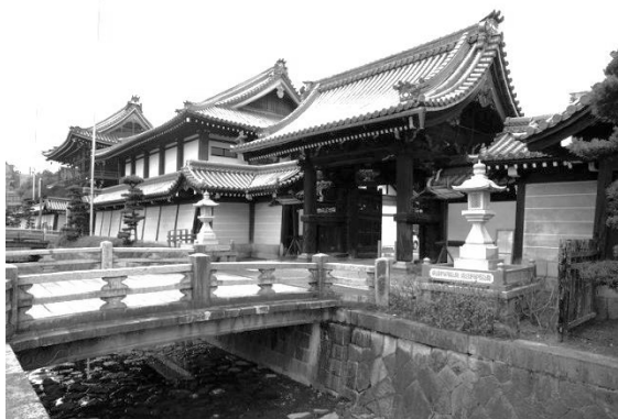
Nishi Hongwanji in Kyoto, Japan