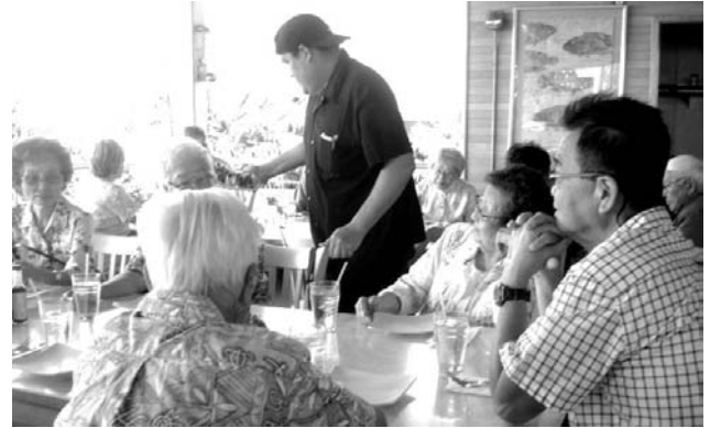
Ice Cream next? HOO – HAH!

Attending the Hanamatsuri service and festivities were members from Lahaina Shingon, Lahaina Jodo Mission, and Lahaina Hongwanji Mission.