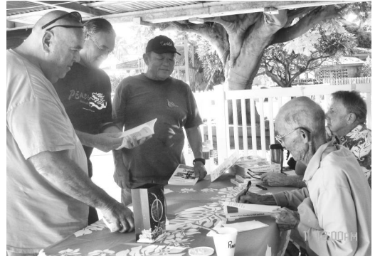
Whole lotta book signing going on!