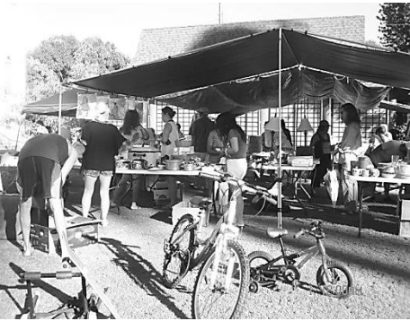
Rummage: "Hey, isn't this what I donated last year?"