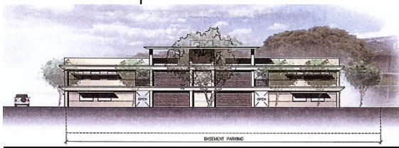
PBA Project: New classroom building, for enrollment expansion.