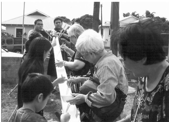
Somen nagashi challenges folks to be snappy with their chopsticks.